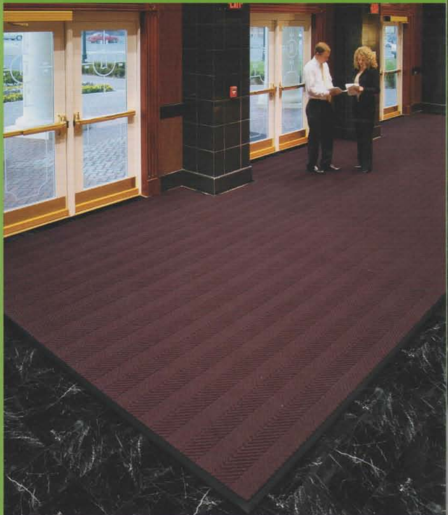
Waterhog Eco Elite Roll Goods