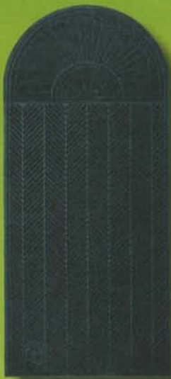
Waterhog Eco Grand Elite (1-End)