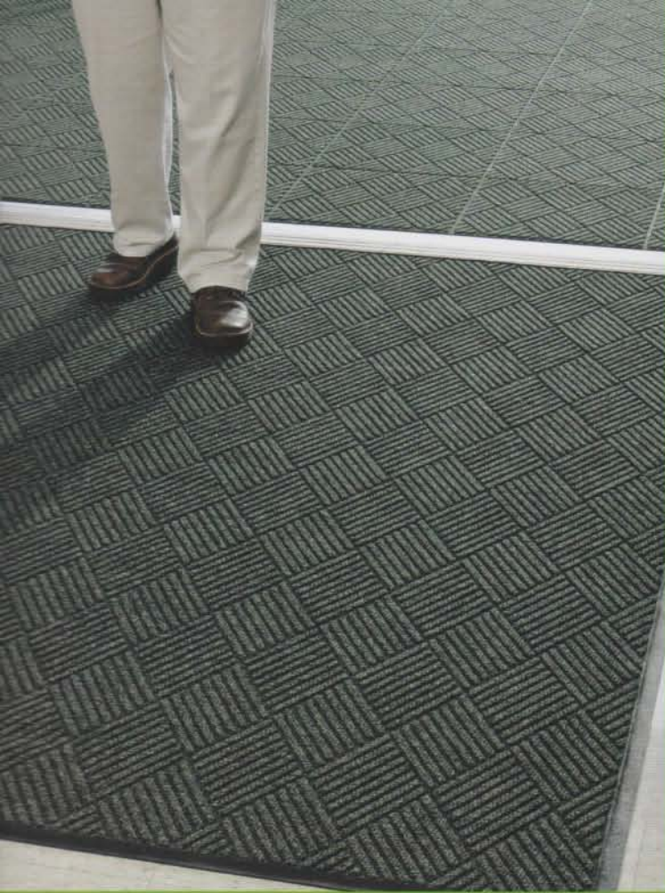
Waterhog Eco Premier and Grand Premier Mats