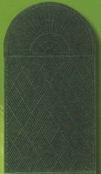
Waterhog Eco Grand Premier (1-End)