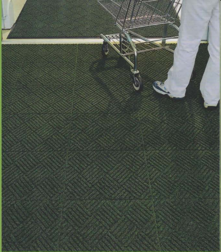
Waterhog Eco Premier Tiles