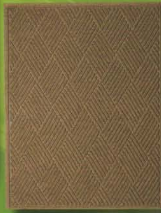
Waterhog Eco Premier Mats