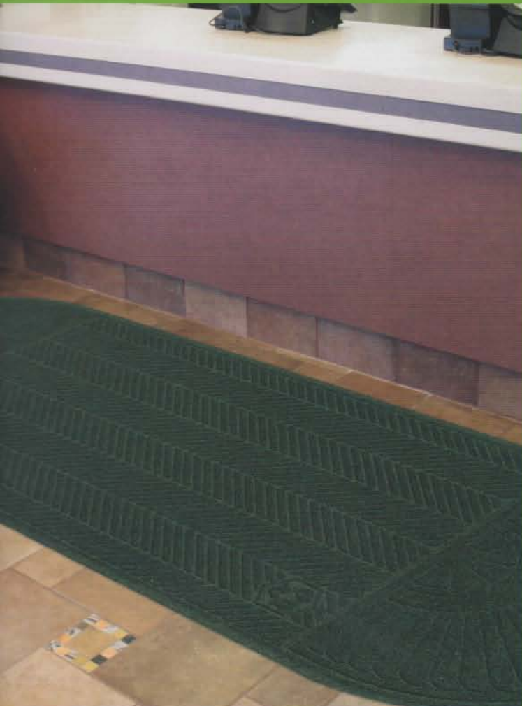
Waterhog Eco Elite and Grand Elite Mats