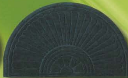
Waterhog Eco Grand Premier 1/2 Oval