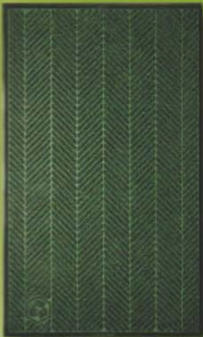
Waterhog Eco Elite Mats & Roll Goods