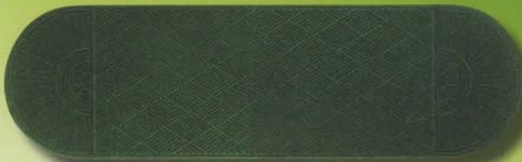
Waterhog Eco Grand Premier (2-Ends)