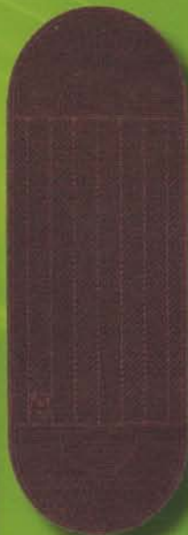
Waterhog Eco Grand Elite (2-Ends)